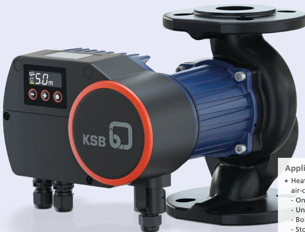
Flanged Calio Pro