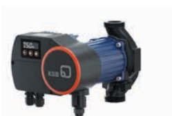
Calio Pro – screw-ended